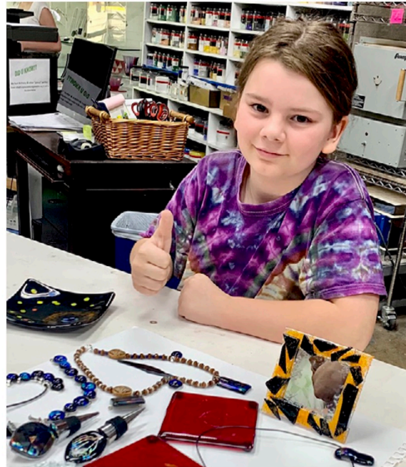
ART GLASS CENTER

Have fun at the AGC creating little glass treasures! Learn basic glass techniques while creating a variety of glass projects including a dish, dichroic glass treasure box, suncatcher, windchimes, jewelry pendant and "animal critter" flowerpot stakes. You will also complete a recycled glass project. All supplies included. More info: karenw@stardustartworks.com; michelerubinglass@outlook.com. 5 sessions.