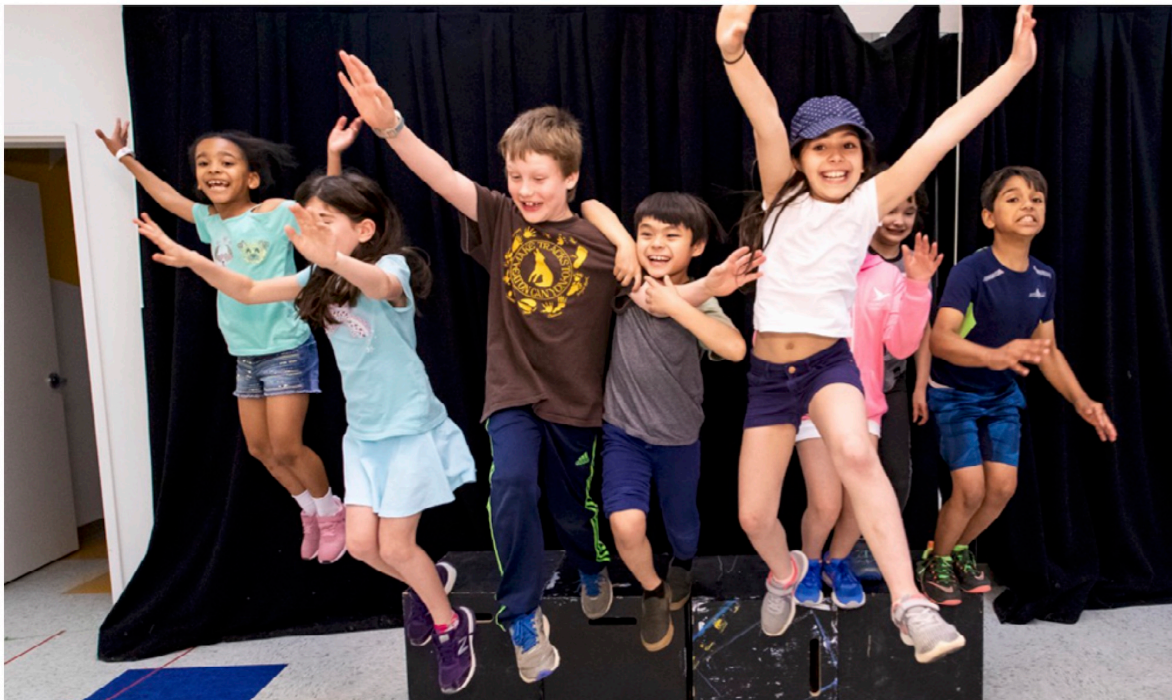
ADVENTURE THEATRE ATMTC

Adventure Theatre MTC is located at the far end of the Arcade Building.