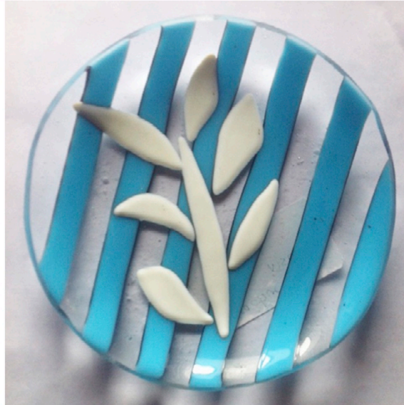
ART GLASS CENTER

Spend part of your Spring Break learning the basics of fused glass art. While learning to plan your projects, cut and assemble glass and finish your work, you will produce several pieces of fused glass art. No experience is required, all supplies included. More info: mwactlar@yahoo.com . 3 sessions.