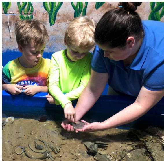
Glen Echo Park Aquarium

Let's go back in time! Become a paleontologist for the week. Participate in an excavation, where you will learn about the role of a paleontologist, through fossils and the creation of 2D and 3D dinosaurs. Explore cave paintings and create your own dinosaur habitat! Tuition includes a $50 non-refundable deposit. Bring a bag lunch as well as a snack and come ready to get messy! More info: STEAMtasticAdventures@gmail.com . 5 sessions.