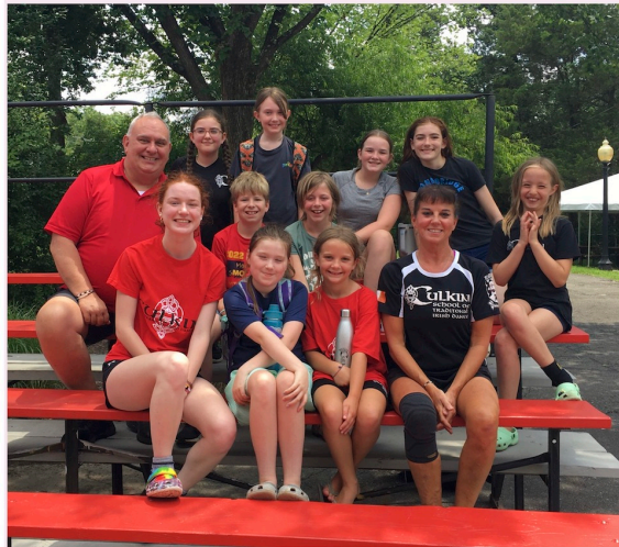
CULKIN SCHOOL OF IRISH DANCE

Culkin School of Irish Dance Faculty Class 1: M-F, Jul 29-Aug 2, 12-4pm, Ballroom Back Room This half day program is for Culkin Dancers in levels 4-7. The program will include dance instruction and practice, fitness and stretching, team building, and Irish cultural activities. It will overlap with younger dancers for lunch and teambuilding. Let's have some fun! Campers are instructed to bring their lunch. We will adhere to CDC and local health and safety guidelines. More info:sean@culkinschool.com. 301.346.1907. 5 sessions.