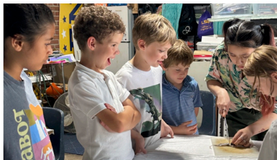
Glen Echo Park Aquarium

Discover the wide variety of critters that inhabit the Chesapeake Bay, from snails to whales to oysters and fishes. This camp will examine habitats, food webs, life cycles and fisheries. Campers will explore the relationships between oyster and bay grasses as well as what happens when the balance is upset. Learn about blue crabs and how their population is tied to the population of jellyfish. The geologic history of our Chesapeake Bay as well as human history will be discussed too. This camp will incorporate games, and crafts to bring your learning to life. A $50 non-refundable deposit is included in the tuition. More info: info@GEPAquarium.org or 301.955.6256. 5 sessions.