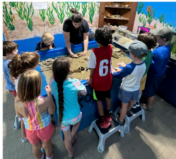
Glen Echo Park Aquarium

Join us for a day of fun as we learn about some of the largest sharks to ever grace the oceans. We will explore sharks from millions of years ago all the way to our present-day apex predators. A $15 non-refundable deposit is included in the tuition. More info: info@GEPAquarium.org or 301.955.6256. 1 session.