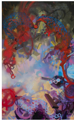
R: J. Jordan Bruns, Communication no. 3 (2017), mixed media paint on panel