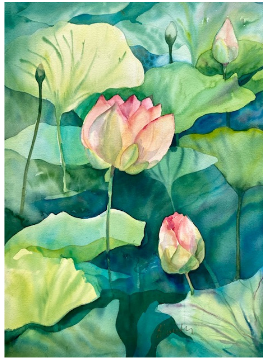
Bonny Lundy, Deep Pond (2021), watercolor